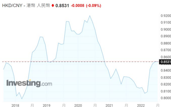
Fig. 2 Changes in HKD/CNY Exchange Rate

The other factor is the Sino-U.S. political game. In June 2020, Hong Kong National Security Act has been passed, after which Donald Trump announced the US-Hong Kong Policy Act stipulated in 1992 has been canceled [9]. In the US-Hong Kong Policy Act, free convertibility between the USD and HKD had been allowed, becoming the base of the Hong Kong linked exchange rate system [10].